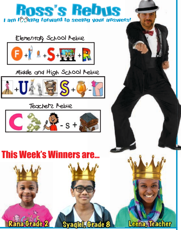
Solutions from the last week: Elemetary Schol: Chocolate Chip Cookie; M&H School: Falafel Sandwich; Teachers: Summer Holiday;